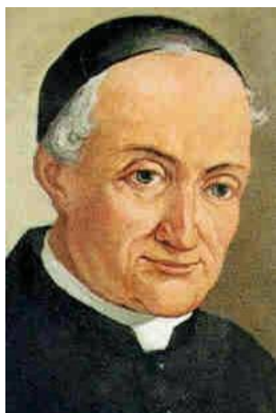
St Gaspar Bertoni 1777-1853

Gaspar, even from the moment of his First Holy Communion, longed for a life of spiritual union with Jesus. This desire led him to enter seminary and to the priesthood. The new priest was entrusted with the care of the youth and to the care of religious sisters, and, in time, the